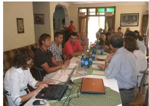
Group work during Shiroka workshop

countries. The dialogue between the two governments on issues related to the lake environment began in 1995, but it was only in May 2003 that the Memorandum of Understanding (MoU) for the Protection and Sustainable Development of Lake Shkodra was formally signed by the Ministers of Environment in Albania and Montenegro. By doing so, the two countries committed themselves to conserve the natural resources of Lake Shkoder in a coordinated and integrated manner; to establish a bilateral Lake Management Commission; and to improve regulatory and institutional capacities. However, relatively little has allegedly been done since this MoU was signed.