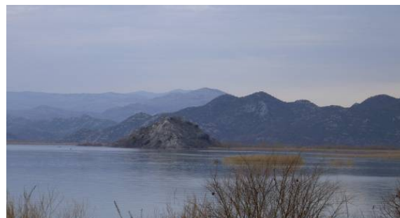
Lake Shkodra (Montenegrin part) March 2008

Attempts have been made so far in the DRIMON project to integrate natural and social science perspectives, and at the same time to identify environmental goals and provide guidelines as to how these goals may be met, through an understanding of institutional structures across borders and enhancement of the dialogue between decision-makers, stakeholders and scientists.