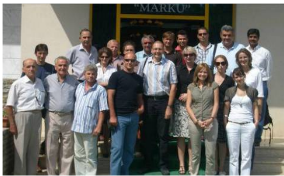
Participants at the workshop, Shiroka, Sept 2008

The stakeholders present at the workshop represented a fairly wide spectrum of agencies, including the Department of Water Resources, Tourism, Agriculture, National park management, research institutes and NGOs from both countries. The discussions led to a good overview of the current challenges and management status on the Montenegrin and Albanian part of the lake Shkodra/Skadar. Overall, the stakeholders expressed that it was a good exercise and more such workshops should be organized in the future to promote dialogue between the stakeholders from the two countries.