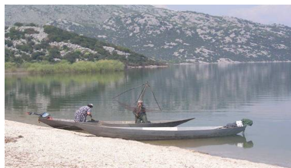
Local fishermen in Lake Shkodra/Skadar whose livelihood is based on lake fisheries

drivers impacting the lake environment. According to them, vegetable production and vineyards are increasing, the latter presently amounting to about 2400 hectares on the Montenegrin side and 1400 hectares on the Albanian side. Deforestation and clearing of land for agriculture along the lake shores by migrants moving down from mountaneous areas was reported to be a serious problem on the Albanian side, and the stakeholders expressed a serious need to regulate the agricultural development in order to reduce the negative pressures and impacts.