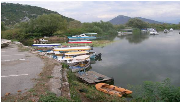
Tourism development may cause habitat disturbances (Skadar lake near Virpazhar, 2007)